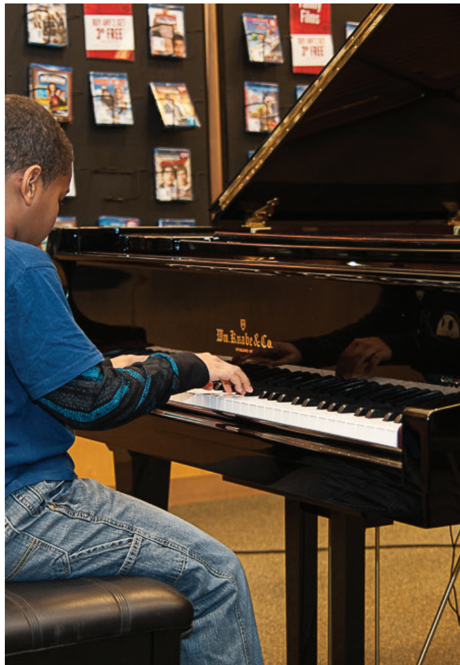
Performance at 2014 MLK Freedom Library Book Fair

We equip youth and adults to move us closer to what Dr. Martin Luther King, Jr. called the “Beloved Community.” We are committed to educating youth and adults to meet divisions in communities with a deep understanding of racism, economic oppression, and violence, and with the multifaceted tools of active nonviolence.