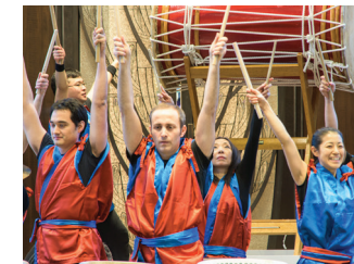
Shinnyo-En Buddhist Temple Drummers perform at the 2015 MLK Interfaith Concert

With the Interfaith Connection, we hold the annual MLK Interfaith Concert in early January to honor Dr. King's birthday. The Interfaith Concert is a musical celebration to showcase the diversity of musical traditions from our faith communities and to unite us through music and the common goal of Love for our Neighbor.